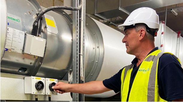
The last check of the installaton before commissioning