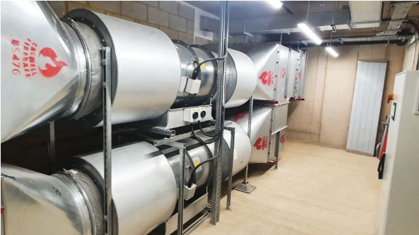
NOVENCO® ZerAx®axial smoke fans in operation