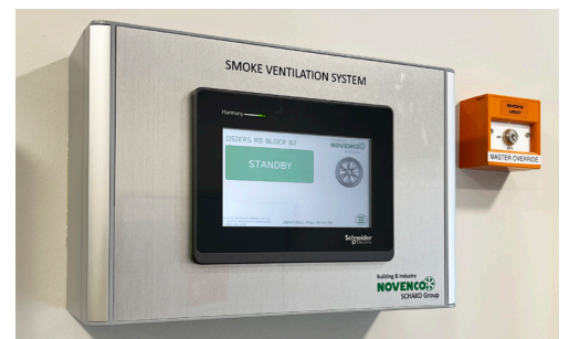
NOVENCO's remote control panel to provide full system status overview