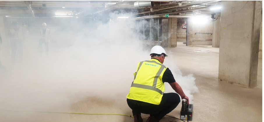
The NOVENCO’s smoke clearance system test in carpark