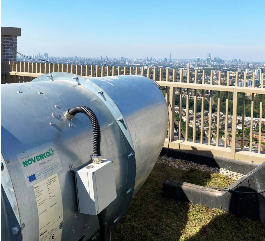
NOVENCO ZerAx fans installed on the roof of the 34 storey building