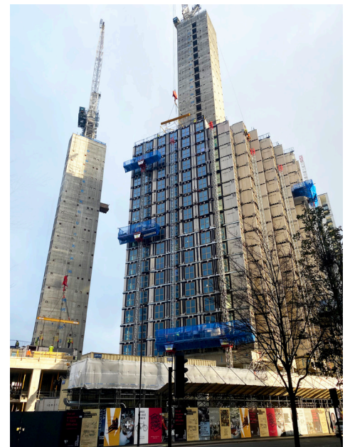
Incredibly quick and efficient modular construction

due to their high efficiency and 98% recyclability rate after a 20+ years life span.