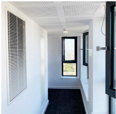
EN12101-8 compliant smoke control dampers