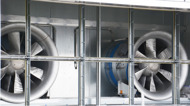
NOVENCO ZerAx ® axial fans in parallel operation

The ventilation had to be completely renewed for one of the largest production buildings of the factory. Higher air volumes were needed and the space available for the installation of the equipment was insufficient. Therefore, a new installation location for the AHUs had to be found on the roof. The large 80,000 m 3 /h units were placed on a steel platform on the connection between two buildings. In addition to saving energy, the criteria unit size, weight saving and noise reduction were therefore also key requirements.