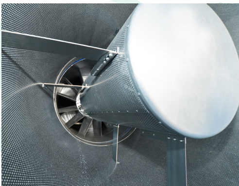
ZerAx® fan - view of the acoustic diffuser: aerodynamic component and silencer in one.