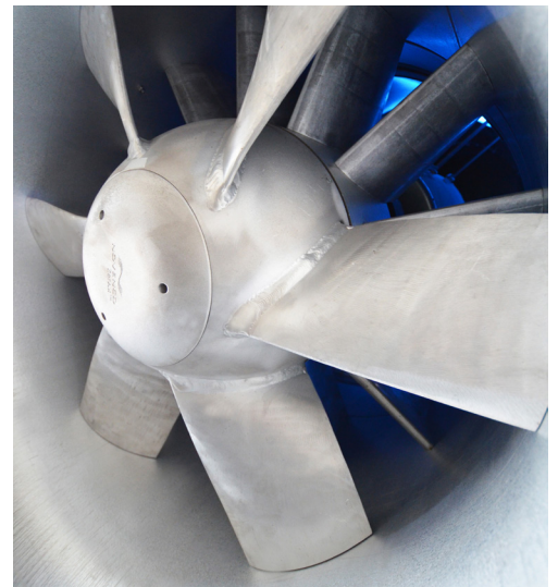
Highly efficient axial fans with aerodynamic design for the highest pressure increase

Since the beginning of 2017, Volkswagen has been intensively investigating the technical possibilities of high-efficiency axial fans and has carried out a whole series of tests, measurements and practical trials. At the beginning of 2018, it was time for the next step: implementation of the obtained results and knowledge in new air conditioning technology. Two production sites in two countries had air handling units with new technology and highly efficient axial fans installed – at Porsche in Stuttgart/Zuffenhausen, Germany and at Volkswagen Navarra in Pamplona, Spain.