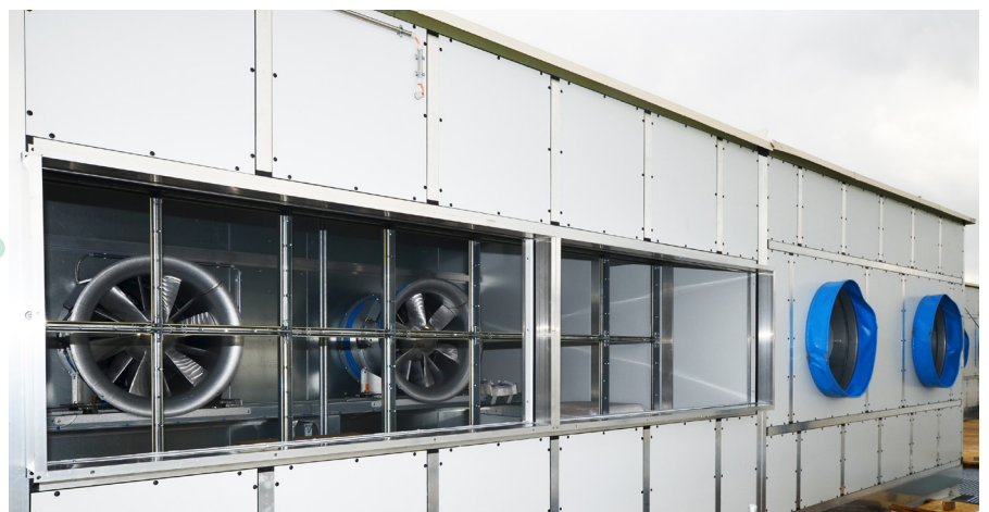
View of air supply and exhaust unit

• NEW AHU TECHNOLOGY LEADS TO 20% ENERGY SAVINGS AND IS 30% SHORTER AND 30% LIGHTER