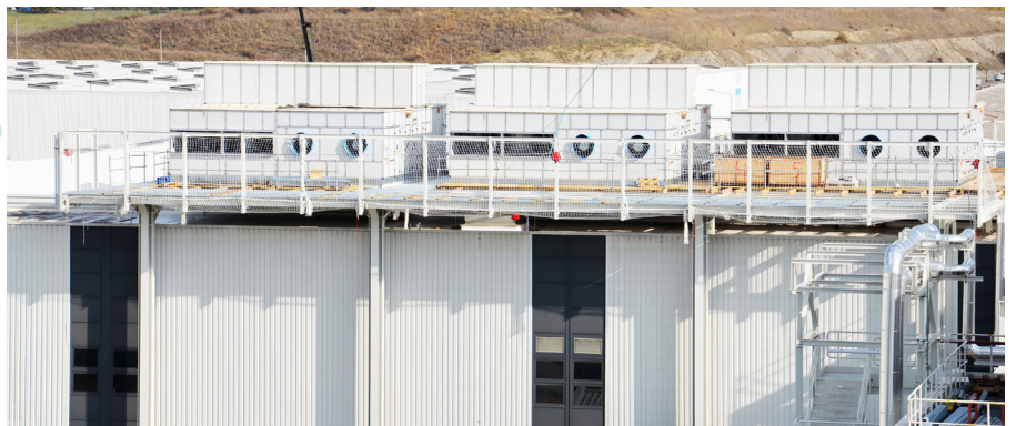
Centrally above the company premises hover the latest generation of AHU devices. The supply air fans are directly at the end of the device.