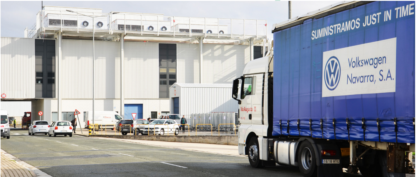
Roof-installed AHUs, each on a steel construction