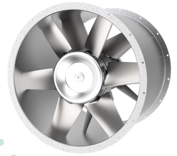
NovAx™ axial flow fan