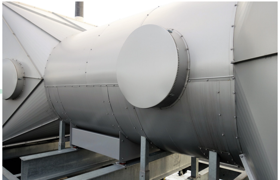
Fan section with NOVENCO NovAx™ fan