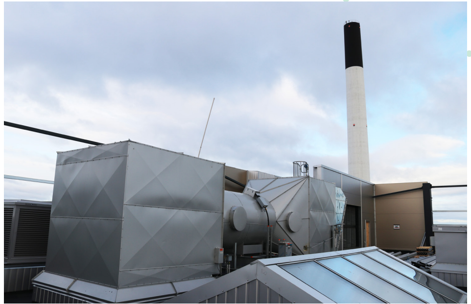
NovAx™ built-in AHU on the top of the Amagerværket power plant