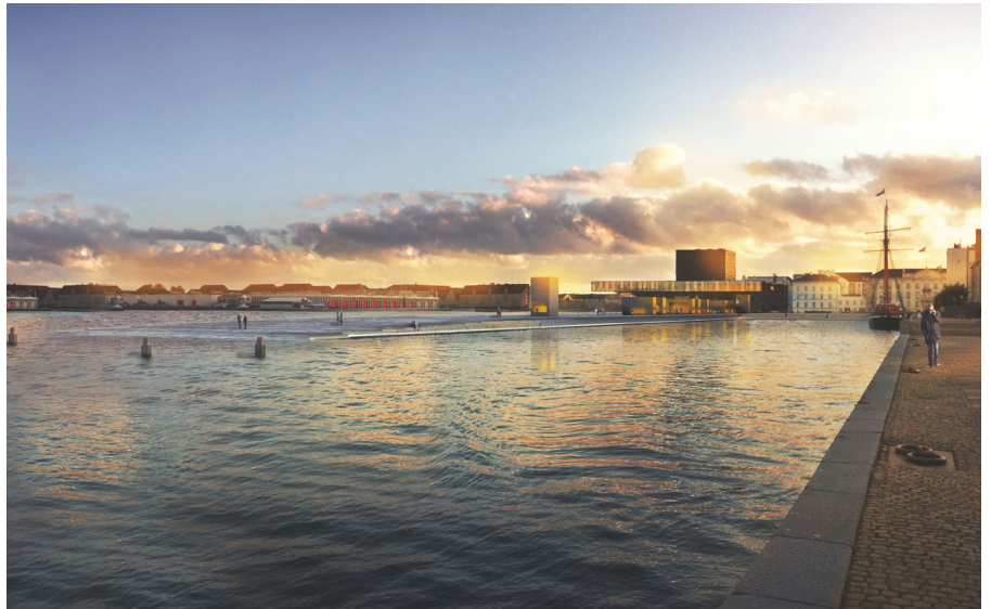
The Kvaesthus car park is a very unique construction with its 3 levels built below water surface