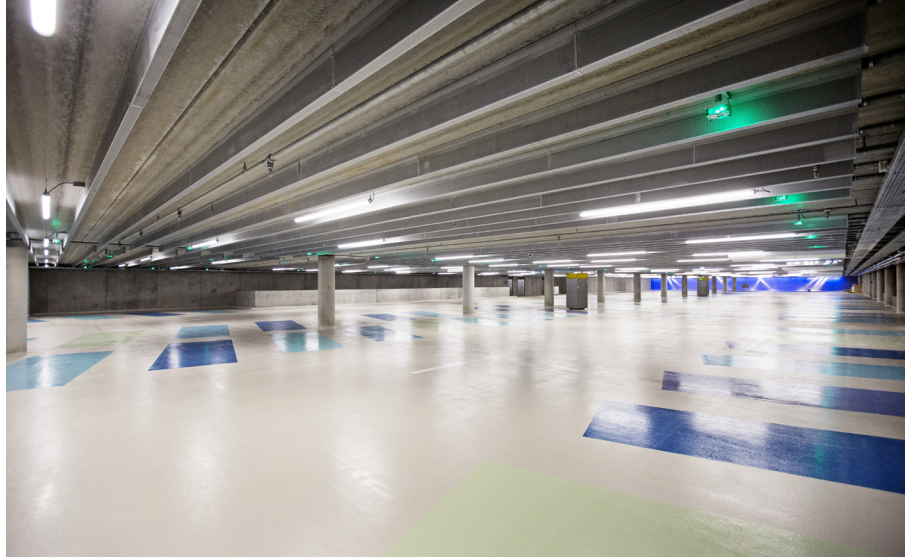
24 AU0 Jet Fans keep the Kvaesthus car park air clean from CO/NOx and CH and take care of smoke exhaust after fire