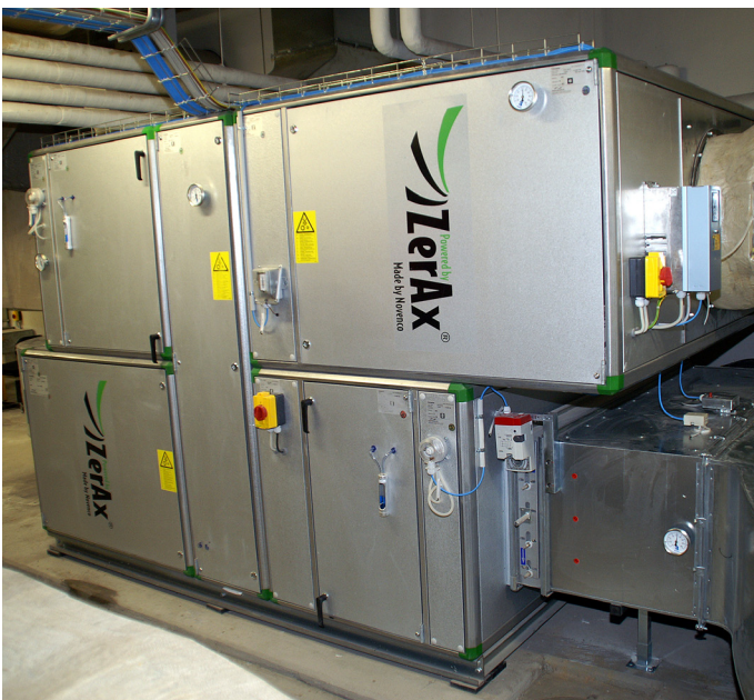
Air handling unit Climaster ZerAx® installed in Aarhus Concert Hall