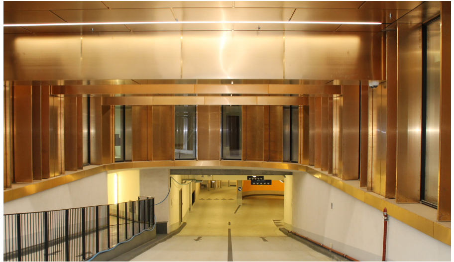
Five storeys of a safe underground car park