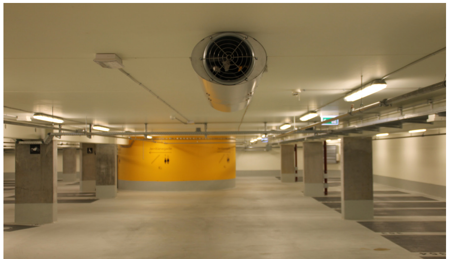
Installation with NOVENCO jet fan AUO