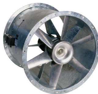
Axial flow fan NovAx ACN 560