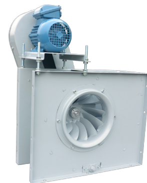
Centrifugal fan CNA 250