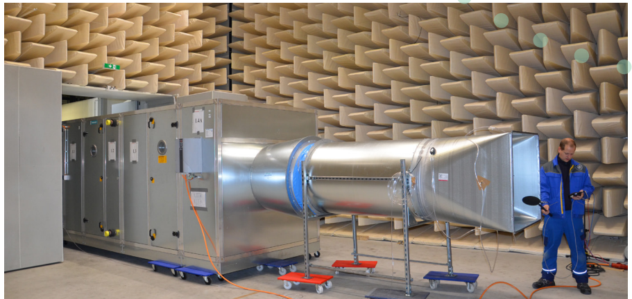
TÜV Süd testing laboratory