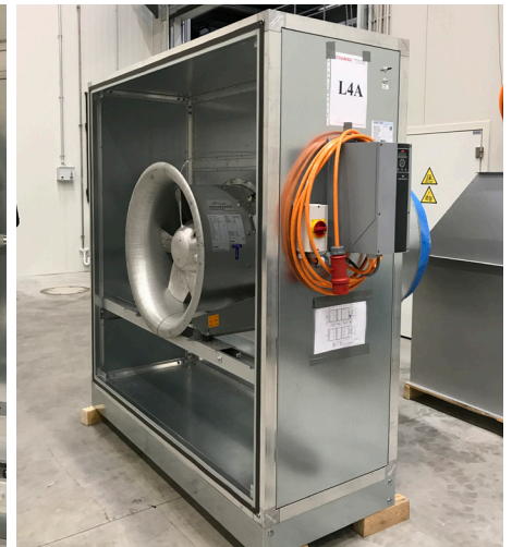
ZerAx® axial flow fan in AHU section